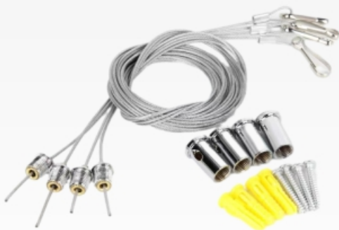
Cable Kit: NX-DS4